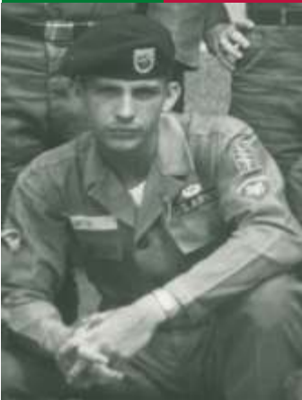
Billy M Smith Memorial Chapter